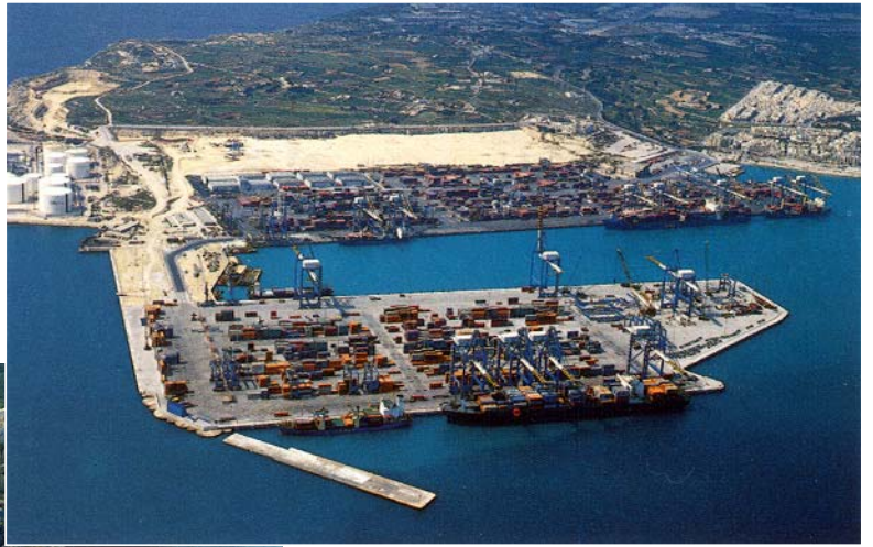
Realised new port, 1999